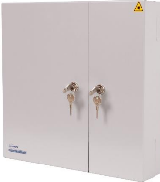
MPIC-4 – General view