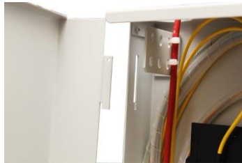
Removable door detail view