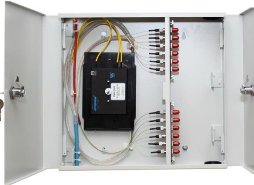
MPIC-4 – Equipped demo