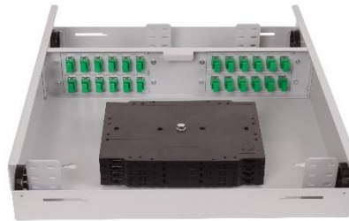
Internal layout (back view)